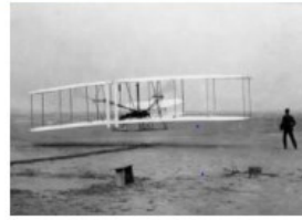
The Wright Flyer