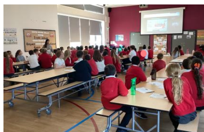
UKS2 World record attempt